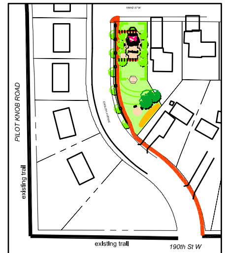
Trail connection to existing 190th St W trail and Pilot Knob Trail