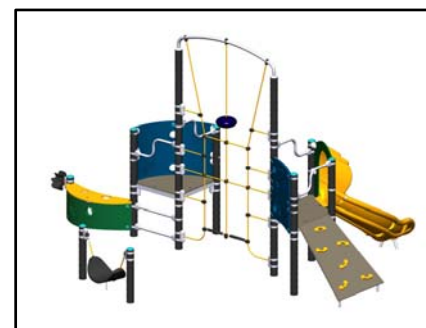
example of play equipment for 3-5 year olds