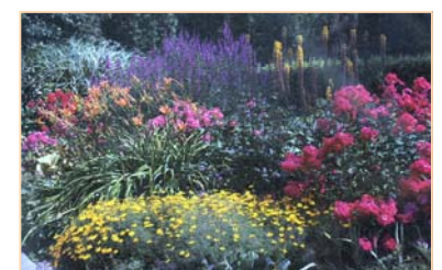
example flower garden