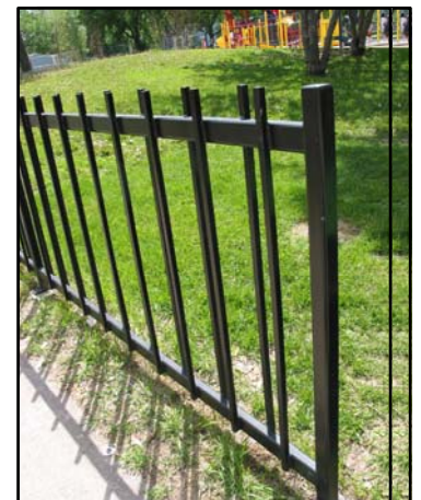
example metal picket fence