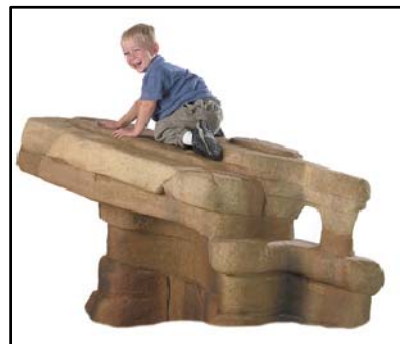
example "play" boulder