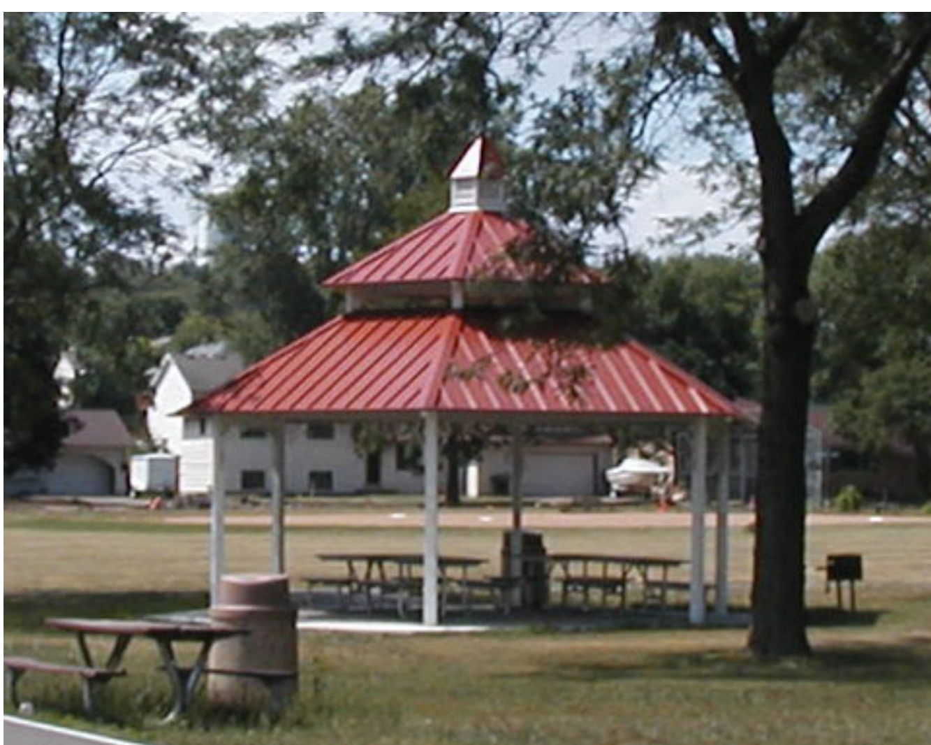
The master plan suggests adding a park shelter, similar to this one, located in Hill Dee Park, for shade, picnicking, and park programs such as "Pooh's Playground."