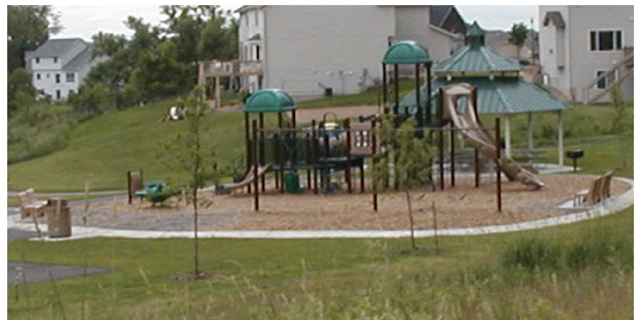
The master plan suggests updating the park's play equipment. A recently installed playground at Meadow View Park is shown above.