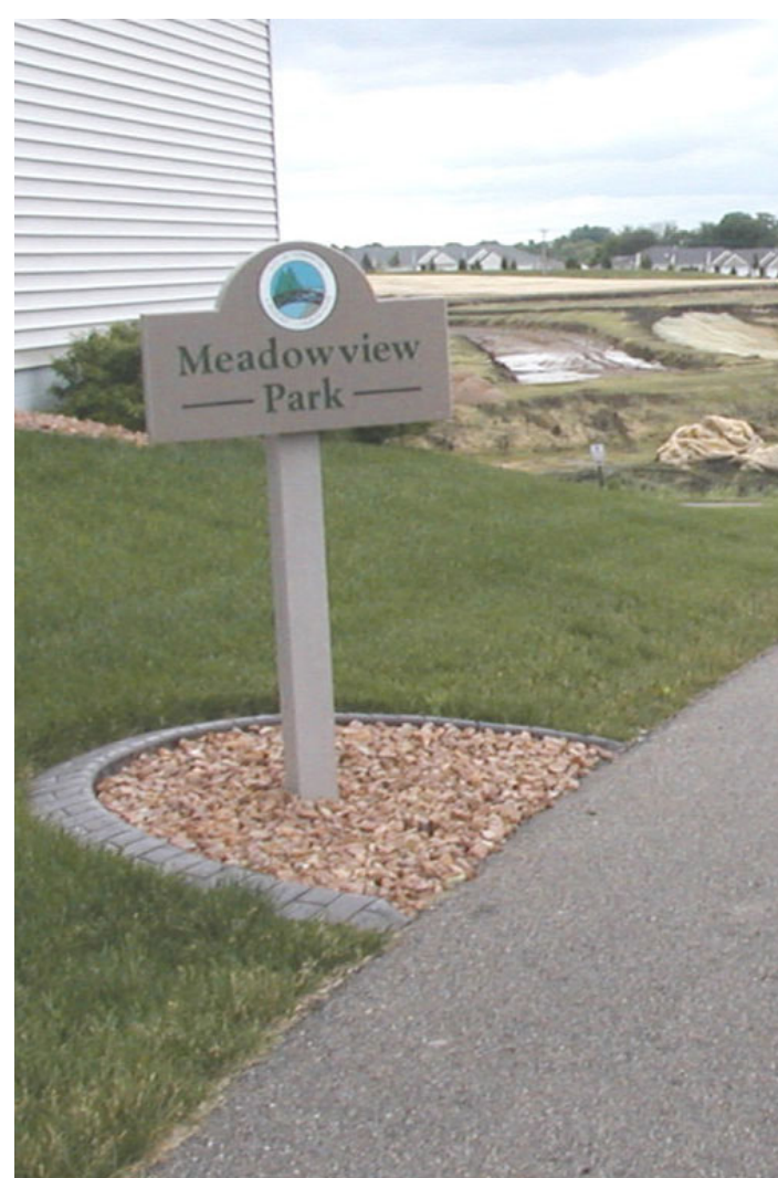
Small park signs will be installed at all trail entrances to the park.